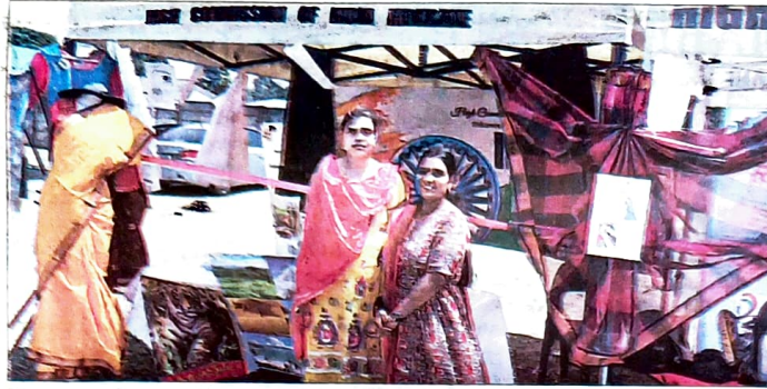
More people wanted to take pictures at the High Commission of India stall.

He explained that by hosting such an event the aim was to try and involve more big businesses from India showcase products and services avail-